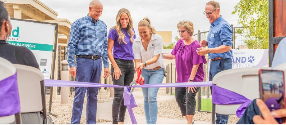
▲ HomeAid Phoenix joined forces with Sojourner Center to provide shelter to those escaping domestic violence.